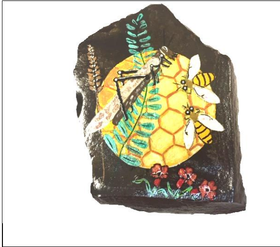
St. John in the Wilderness Anglican Church, Bright's Grove