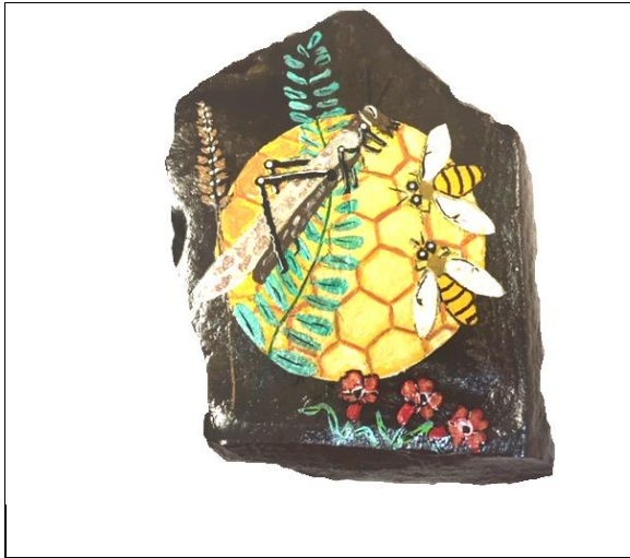
St. John in the Wilderness Anglican Church, Bright's Grove