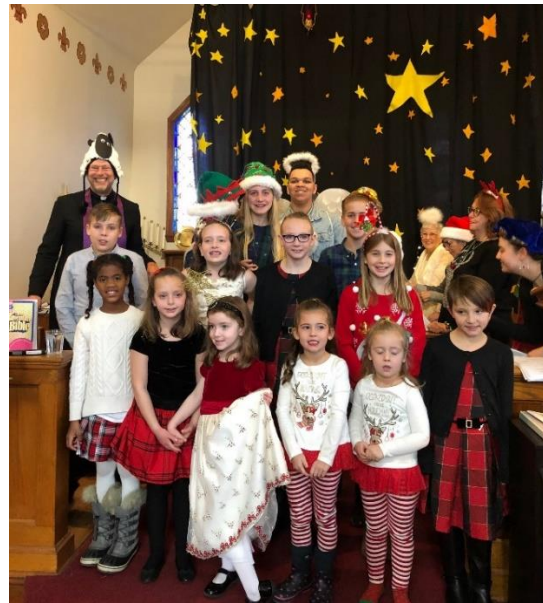
Christmas 2019. We sure miss you folk!