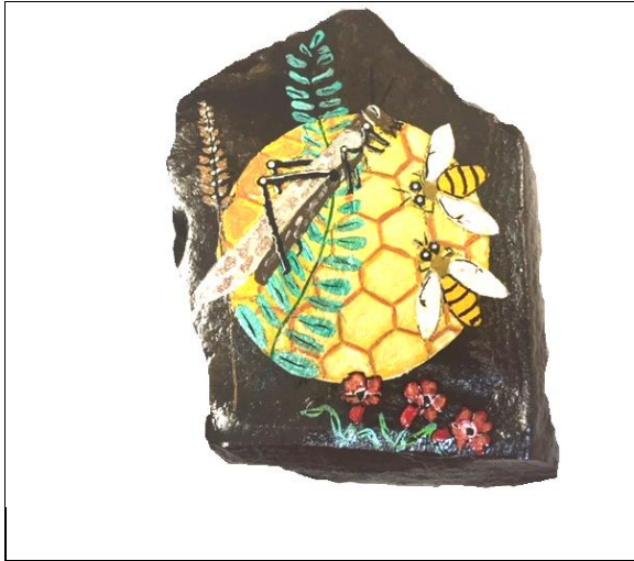
St. John in the Wilderness Anglican Church, Bright's Grove